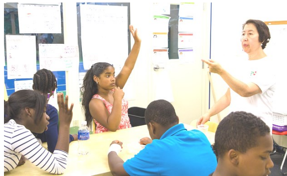
The Learning Center (TLC)