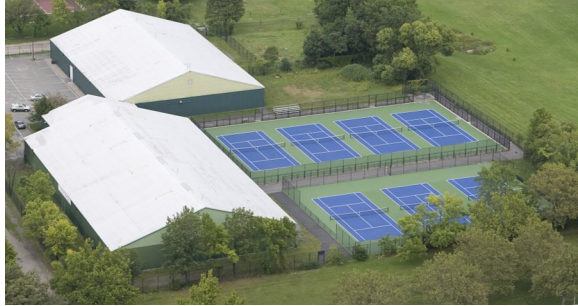
7 Indoor & 7 Outdoor Courts